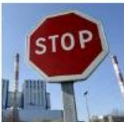
Stop at the junction

The imperative form is used to give orders or instructions, make a request, invitation or offer advice - we usually find them on notices, signs, in recipes and elsewhere. The implied subject in imperatives is the second person (you).