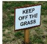
Keep off the grass