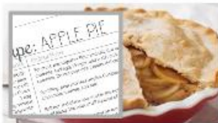
Chop the apples Add a teaspoon of cinnamon Mix well