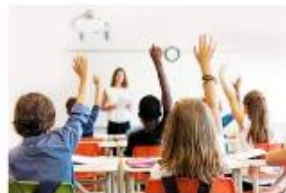
Open your books Sit down Don't talk