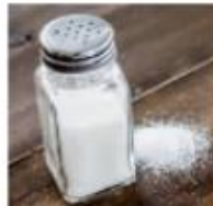
Pass the salt