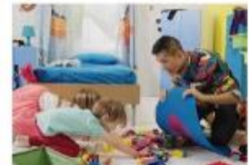
Tidy your room