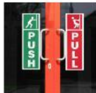
Push to open